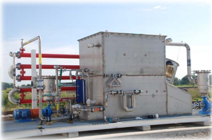
Liquid Fertilizer Processing Skid