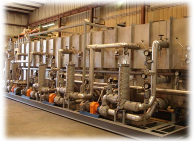
Skid Mounted Wet Scrubber