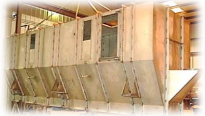
60, 90, and 100 Square Foot Fluid-Beds