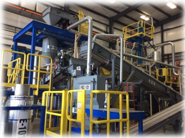
Skid Mounted Fertilizer Plant