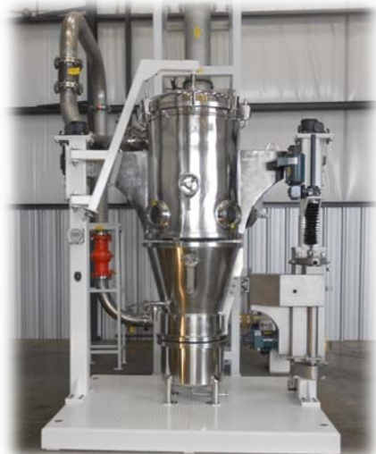
Pharmaceutical Batch Fluid Bed