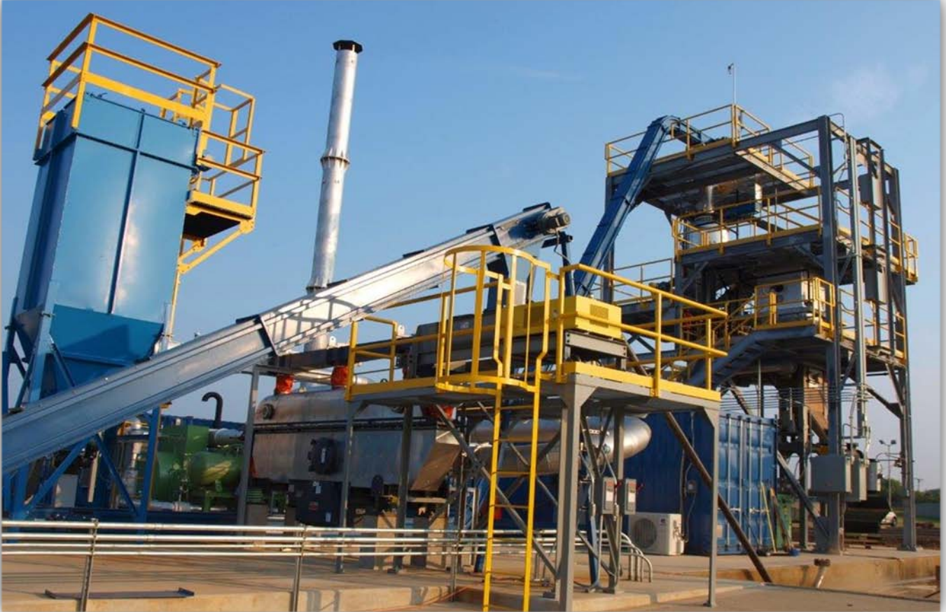
Photo: PHG Energy - Covington, TN Gasification Facility - 2014